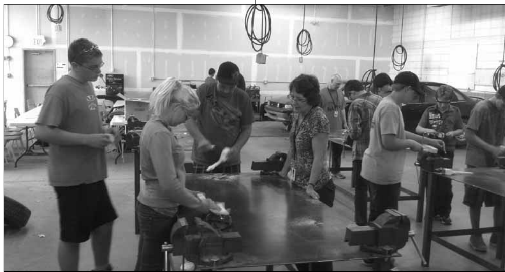
Above: Junior High option class at CTS Central on main street, Claresholm