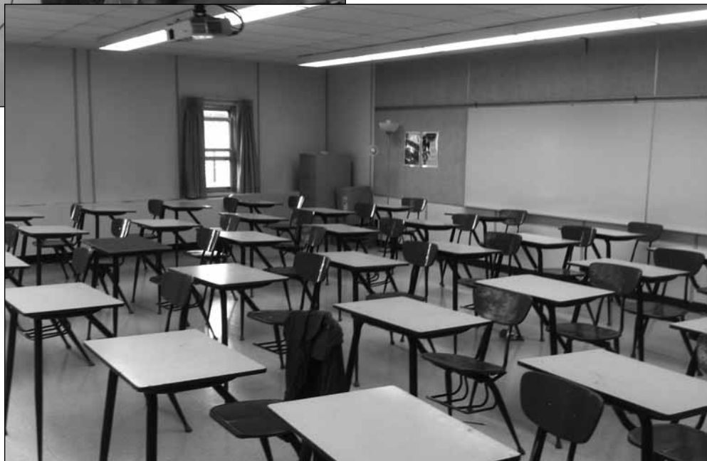
New Sites: Above, the cosmotology students have made themselves at home in CTS Central. Below, inside one of the portable classrooms. The portables are connected with an enclosed hallway, complete with lockers for students.