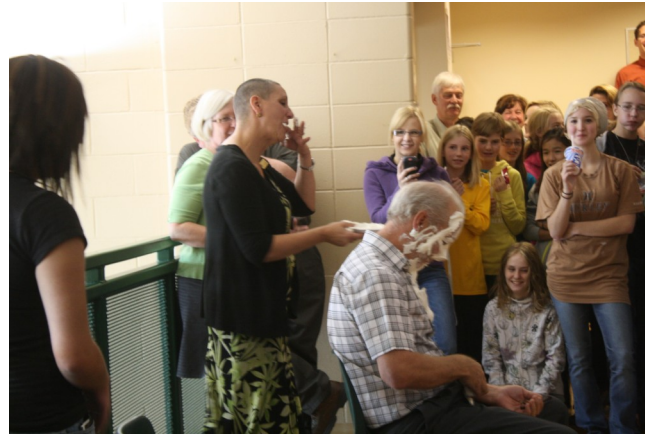
Breast Cancer Fundraiser