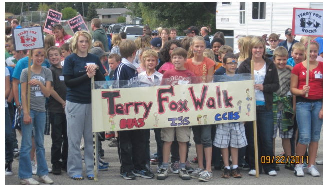
Terry Fox Fundraiser